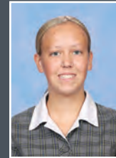
Grace Culbert – Set Design