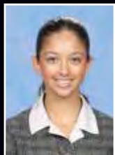
Zara Psirakis Music 1 - Performance

The following students have been nominated